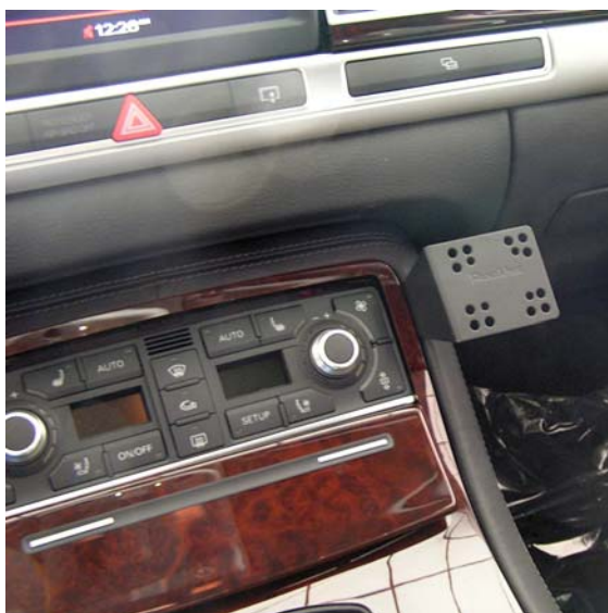
InDash installed showing location