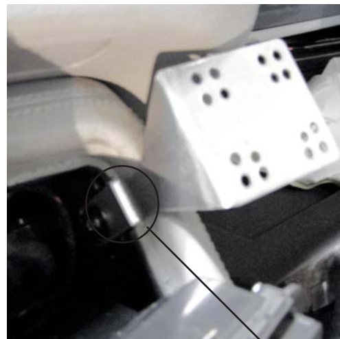
Dash edge to trim area