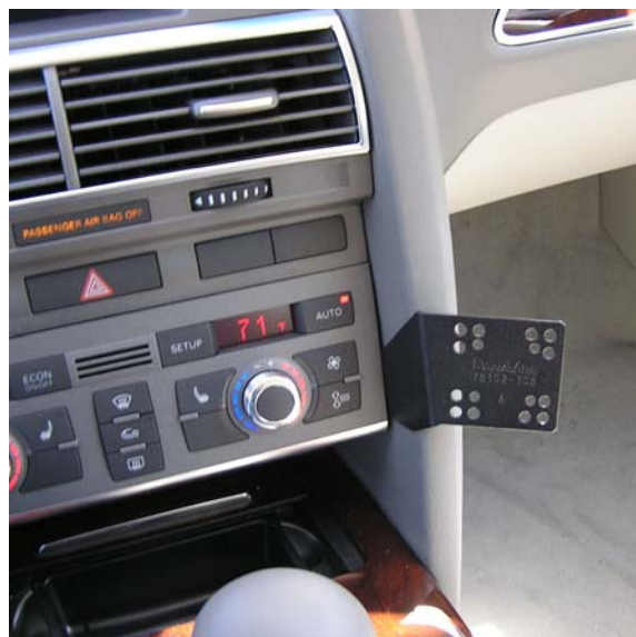
Prototype InDash installed showing location